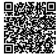
First Nations People