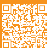
Parent and Carer