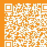
Aboriginal & Torres Strait Islander Peoples