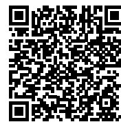
First Nations People